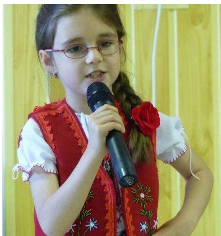
Talent Development C asa Sf. Maria 55 children