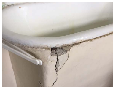
Before the renovation