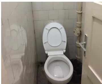
Before the renovation