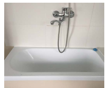
After the renovation