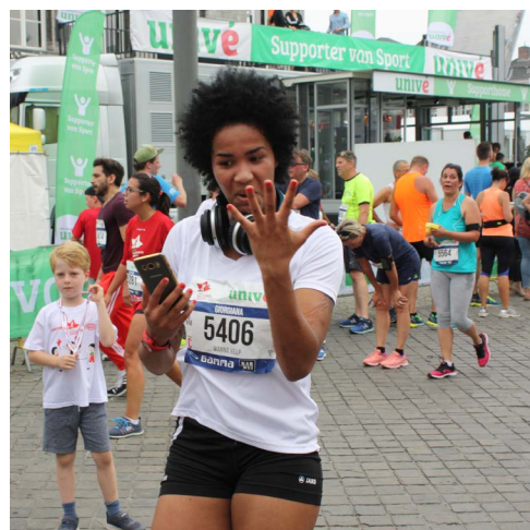
Training Project Betania Bacau for 18 years old + 3 young women in the program