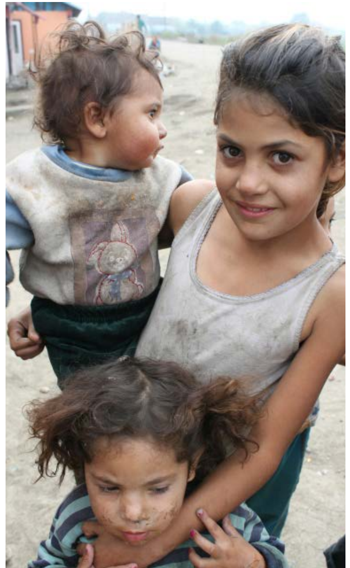
This picture was made in one of the gipsy villages in the neighbourhood of Targu Mures. Many of these children in orphanages have their roots in these types of villages.

Wanna'Help! Foundation has the ANBI Status since 25 March 2014. In the Netherlands this is an important status which allows institutions and companies to donate funds that can be deducted from the income tax up to 50%. For both the donators as well as the foundation, this status is of great benefit.