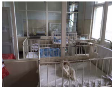
Before the renovation