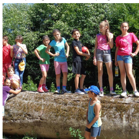
Kids on Holiday Casa Sf. Maria