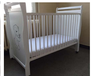
After the renovation