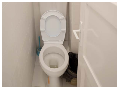
After the renovation