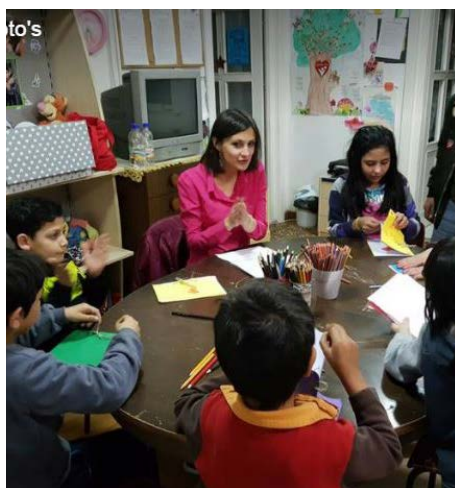
Education Laboratory Casa Sf. Elisabeta 19 children