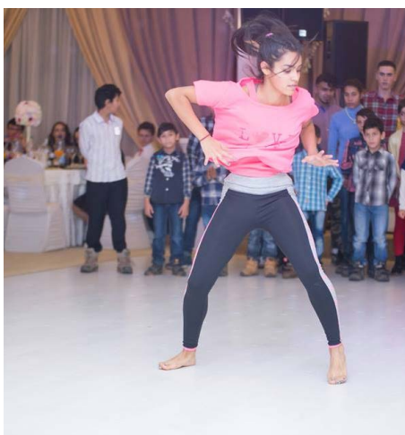
Talent Development Casa Kiwi 10 children