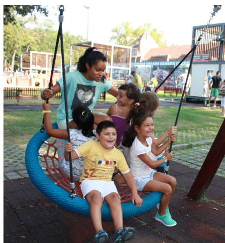
Kids on Holiday Casa Kiwi