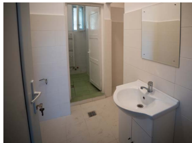
After the renovation